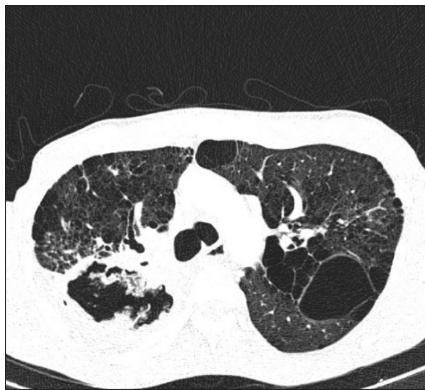
Fig. 2. Computer-tomography chest imaging demonstrating a cavity in the right upper lobe with associated intra-cavity lesion.