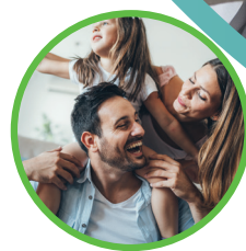
Human Urine Analysis System