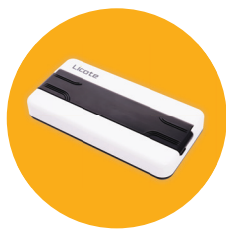
Device Strip Colorimeter